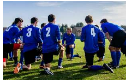
CULTURAL, SPORTS & INTERNATIONAL EVENTS