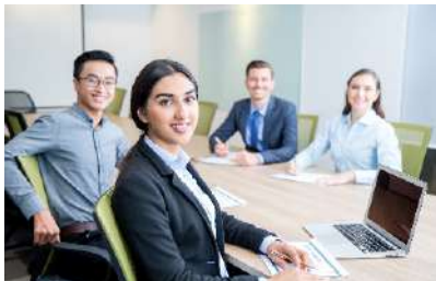
INTERNSHIP & CAREER SERVICES CELL