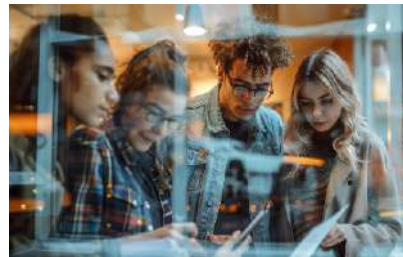
RESEARCH & TECH HACKATHONS