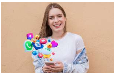
DIGITAL MEDIA CLUB