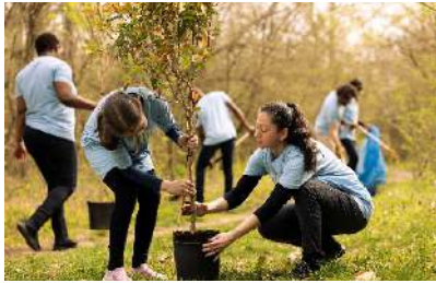
ENVIRONMENT & CSR CLUB

A career-driven BBA programme designed to meet student aspirations and parental expectations.